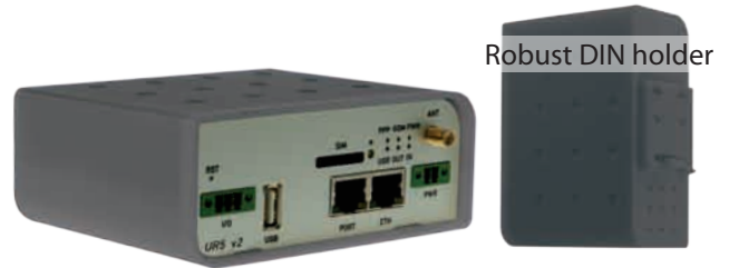
Version in plastic housing