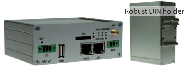
Version SL - metal housing