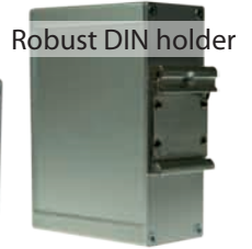
Version SL - metal housing