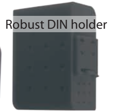
Version in plastic housing